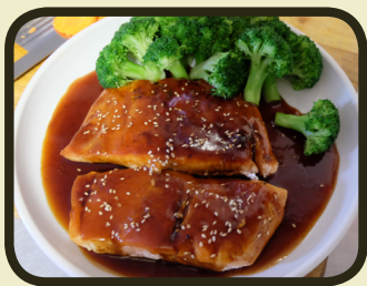
Salmon Teriyaki 18.95

The items below served with your choice of steamed Jasmine rice or Brown rice