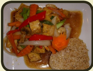
Pad Prik Pao

Sautéed, string bean, bamboo shoots, bell peppers, onion, and fresh basil with chili sauce.