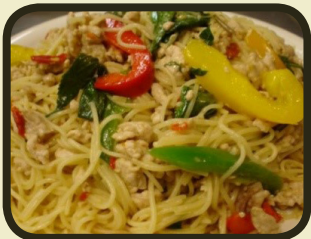
Thai Lo Mein

Stir-fried with carrot, onion, bell peppers, baby corn, basil, bamboo shoot, and egg in chili garlic sauce.