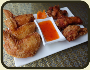
Thai Chicken Wings

Golden Shrimp (5) 5.95 Season shrimp wrapped in spring roll pastry served with sweet and sour sauce.